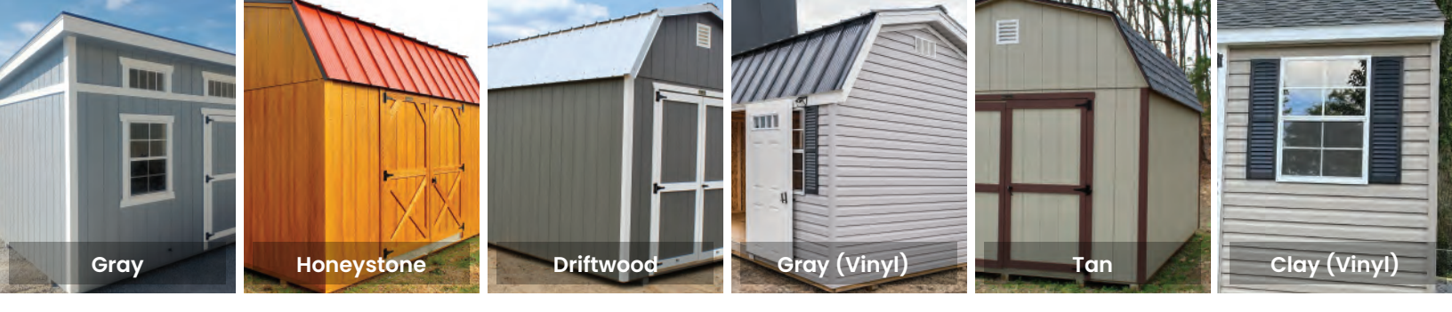
Samples of some of the most popular color options selected by our customers